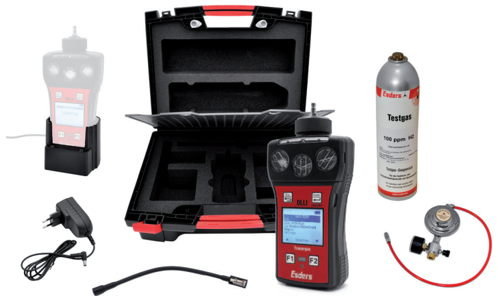
OLLI Tracer Gas in a set